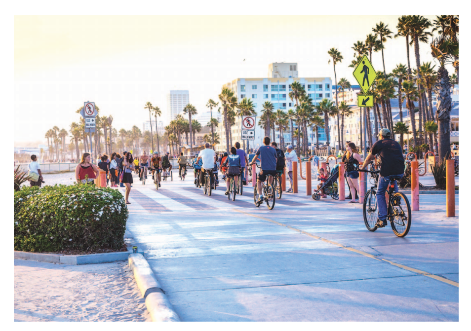
*California law requires all bicyclists under the age of 18 to wear a helmet.

beaches.lacounty.gov/la-county-beachbike-path