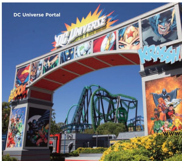
DC Universe Portal

If you want to save the world this holiday season, get ready for JUSTICE LEAGUE™: Battle for Metropolis . You and your family can join members of the JUSTICE LEAGUE™ Reserve Team to save the city of Metropolis from Lex Luthor, The Joker, and their villainous friends. In this incredible 4D ride experience, you'll "battle alongside iconic DC Super Heroes," including Batman, Superman, Wonder Woman, The Flash, Cyborg and Green Lantern, and face wind, fire, mist, fog, and other special effects, all while traveling on a high-speed chase through the streets of Metropolis!