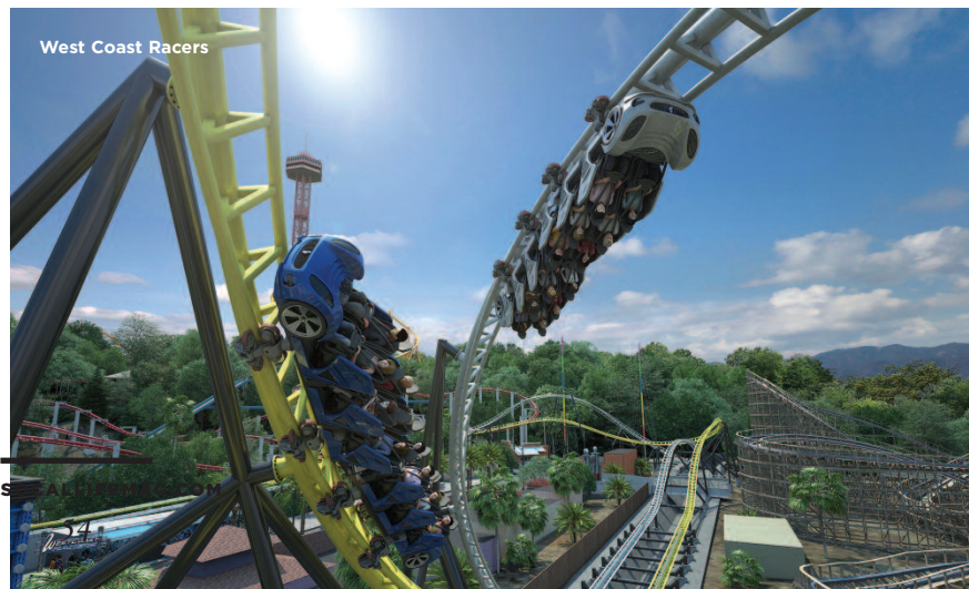
West Coast Racers

Please visit www.sixflags.com/magicmountain for current hours, events, tickets, and season-pass info. ❖