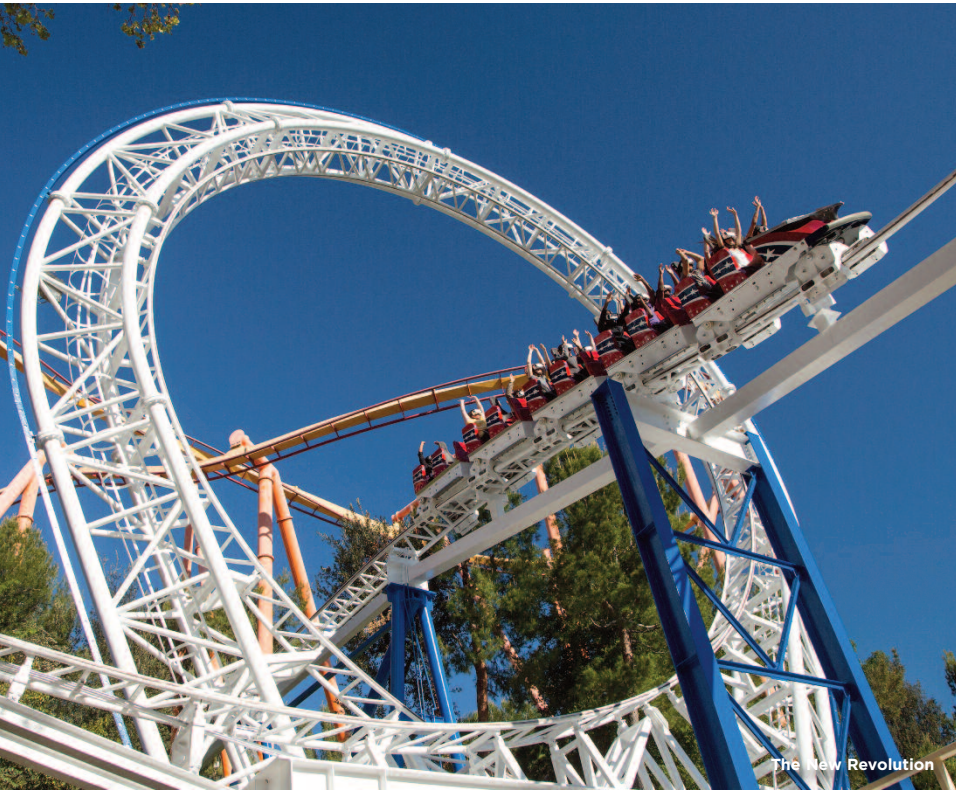
The New Revolution

Little thrill seekers won't want to miss Speedy Gonzales Hot Rod Racers . This mini-coaster offers hot rod race cars that turn and drop as they race around the grand prix track, and is the fourth roller coaster in Bugs Bunny World , the park's six-acre, interactive children's area — more than any other theme park in the United States.