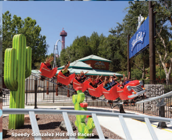
Speedy Gonzales Hot Rod Racers