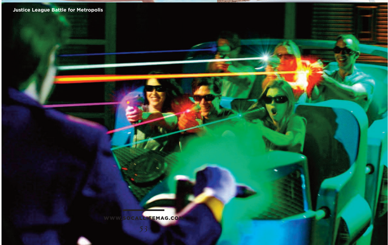
Justice League Battle for Metropolis